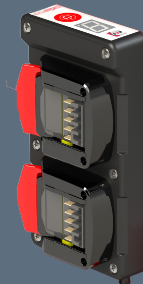
easy to attach/detach click system