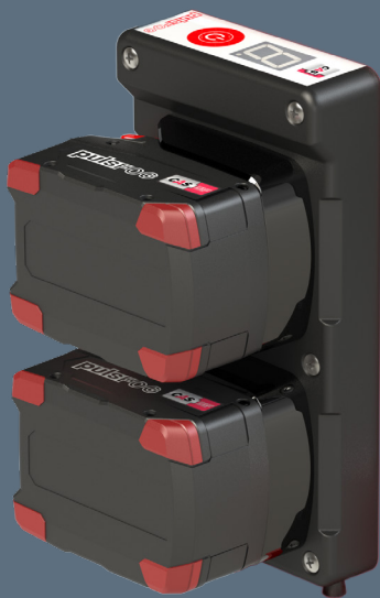
2 x 18 V battery 5,2 Ah (CAS)

A powerful 500 W motor impresses with its fog throwing range of up to 20 m 3 preset power levels help the user to set the correct strength of air flow.