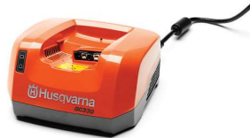
HUSQVARNA CHARGER QC330 967 09 14-05