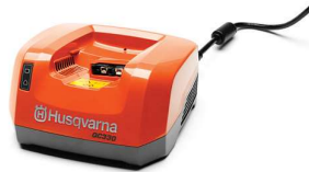
HUSQVARNA CHARGER QC330 967 09 14-01