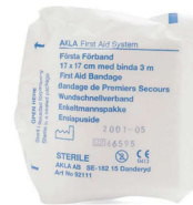
PRESSURE DRESSING 505 66 52-06