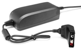
HUSQVARNA CHARGER QC80 967 33 56-31