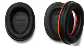
X-COM R HYGIEN KIT 596 48 94-01