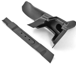
HUSQVARNA MULCH KIT 590 79 09-01