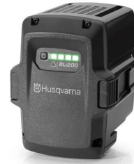
HUSQVARNA BATTERY BLI200 967 09 19-01