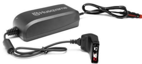
HUSQVARNA CHARGER QC80F 967 62 83-01