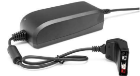
HUSQVARNA CHARGER QC80 967 33 56-51