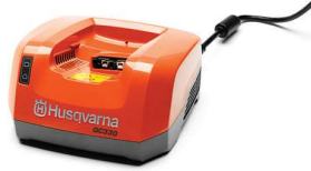
HUSQVARNA CHARGER QC330 967 09 14-03