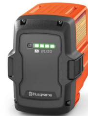
HUSQVARNA BATTERY BLI30 967 93 77-01