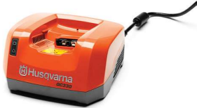
HUSQVARNA CHARGER QC330 967 09 14-02