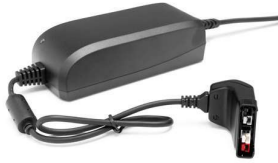
HUSQVARNA CHARGER QC80 967 33 56-61