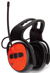
HEARING PROTECTION WITH FM RADIO 578 27 49-03