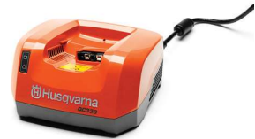
HUSQVARNA CHARGER QC330 967 09 14-04