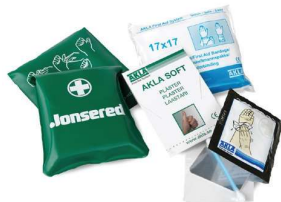
FIRST AID KIT 502 52 55-01