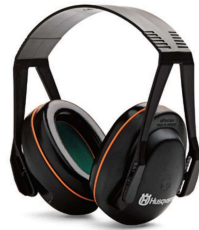
HEARING PROTECTION GARDENER 505 69 90-12