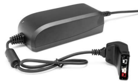
HUSQVARNA CHARGER QC80 967 33 56-41