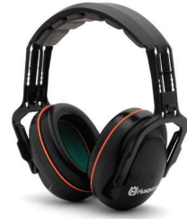
HEARING PROTECTION 505 66 53-04