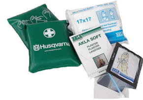
FIRST AID KIT 504 09 53-01