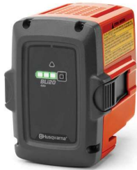
HUSQVARNA BATTERY BLI20 967 09 17-01