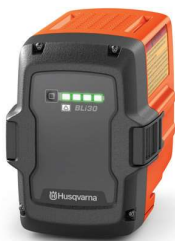
HUSQVARNA BATTERY BLI30 967 93 77-02