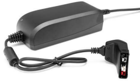
HUSQVARNA BATTERY CHARGER 967 33 56-71