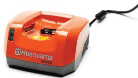
HUSQVARNA CHARGER QC330 967 09 14-06