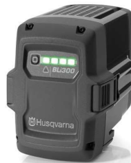
HUSQVARNA BATTERY BLI300 967 07 19-01