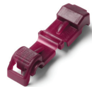
CONNECTOR 535 12 90-01