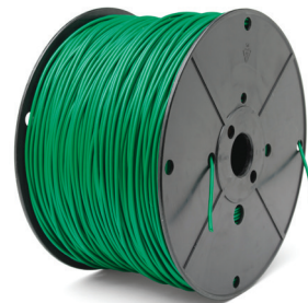
LOOP WIRE 522 91 41-01