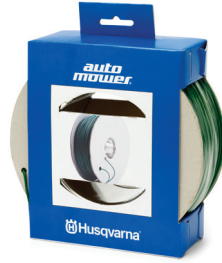
LOOP WIRE 577 86 43-01