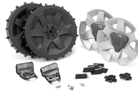
ROUGH TERRAIN KIT 581 88 97-02