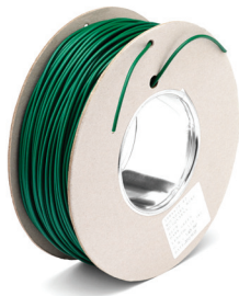
LOOP WIRE 580 66 20-02