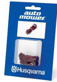
CONNECTOR 577 86 48-01