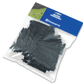
STAPLES 577 86 42-01