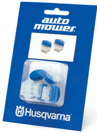
SPLICER 577 86 47-01