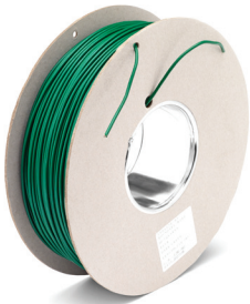
LOOP WIRE 580 66 20-01