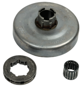
CLUTCH DRUM 503 62 59-04