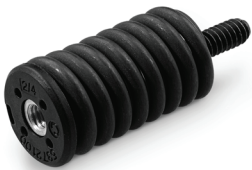
ANTI VIBRATION SPRING 503 46 88-01