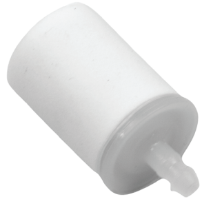
FUEL FILTER FOR MOST OF OUR HANDHELD PRODUCTS 503 44 32-01