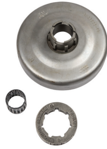
RIM SYSTEM 3/8"X7T 503 62 59-03