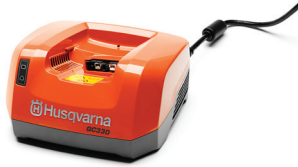
HUSQVARNA CHARGER QC330 967 09 14-02