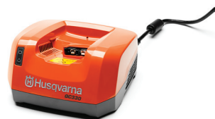
HUSQVARNA CHARGER QC330 967 09 14-05