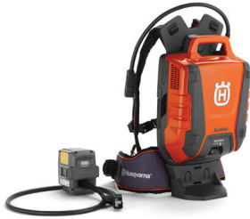
HUSQVARNA Bli950X 967 09 32-01