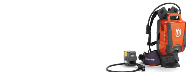
HUSQVARNA BLI550X 967 09 31-01