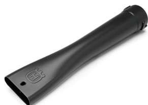
NOZZLE 579 79 75-01