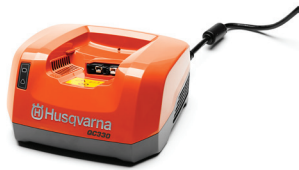
HUSQVARNA CHARGER QC330 967 09 14-04