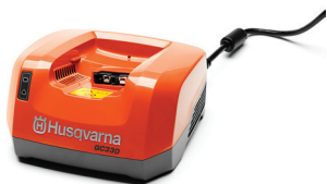
HUSQVARNA CHARGER QC330 967 09 14-01