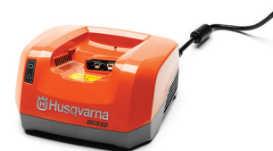
HUSQVARNA CHARGER QC330 967 09 14-03