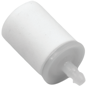
FUEL FILTER FOR MOST OF OUR HANDHELD PRODUCTS 503 44 32-01