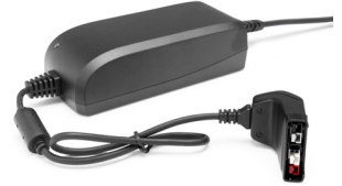
HUSQVARNA CHARGER QC80 967 33 56-51