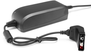
HUSQVARNA CHARGER QC80 967 33 56-41