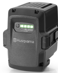
HUSQVARNA BATTERY BLI200 967 96 41-01