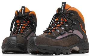
PROTECTIVE BOOTS TECHNICAL 575 35 47-38