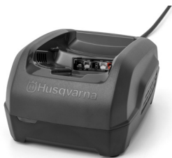
HUSQVARNA CHARGER QC250 967 97 01-03