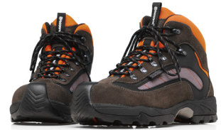
PROTECTIVE BOOTS TECHNICAL 575 35 47-37