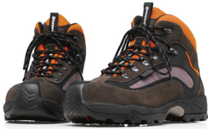
PROTECTIVE BOOTS TECHNICAL 575 35 47-46