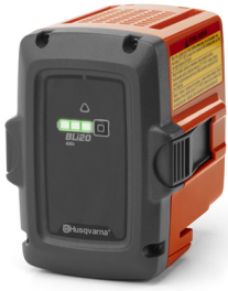
HUSQVARNA BATTERY BLI20 967 96 38-01