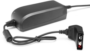
HUSQVARNA CHARGER QC80 967 33 56-31