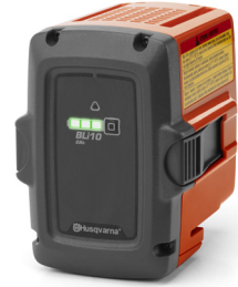
HUSQVARNA BATTERY BLI10 967 09 16-01