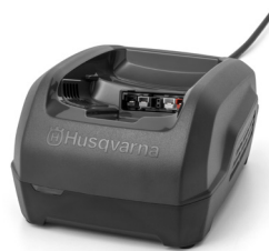
HUSQVARNA CHARGER QC250 967 97 01-01