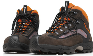
PROTECTIVE BOOTS TECHNICAL 575 35 47-43