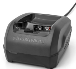
HUSQVARNA CHARGER QC250 967 97 01-04