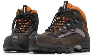
PROTECTIVE BOOTS TECHNICAL 575 35 47-44