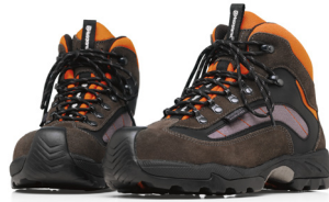
PROTECTIVE BOOTS TECHNICAL 575 35 47-47