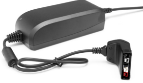
HUSQVARNA CHARGER QC80 967 33 56-61