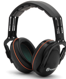
HEARING PROTECTION 505 66 53-04