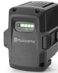
HUSQVARNA BATTERY BLI100 967 09 18-01