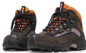
PROTECTIVE BOOTS TECHNICAL 575 35 47-39