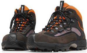
PROTECTIVE BOOTS TECHNICAL 575 35 47-42