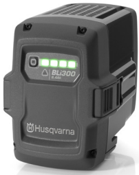
HUSQVARNA BATTERY BLI300 967 07 19-01