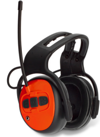
HEARING PROTECTION WITH FM RADIO 578 27 49-03