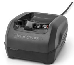
HUSQVARNA CHARGER QC250 967 97 01-02