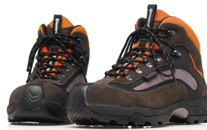
PROTECTIVE BOOTS TECHNICAL 575 35 47-40