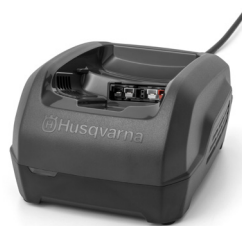
HUSQVARNA CHARGER QC250 967 97 01-05