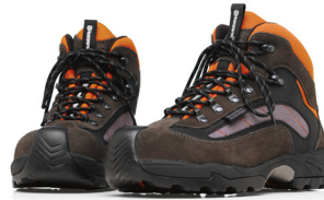
PROTECTIVE BOOTS TECHNICAL 575 35 47-36