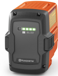
HUSQVARNA BATTERY BLI30 967 93 77-02