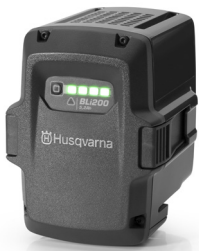
HUSQVARNA BATTERY BLI200 967 09 19-01