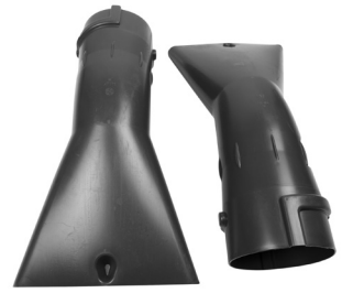
FLAT NOZZLE 570BTS, 580BTS, 570BFS, 580BFS 576 58 27-01