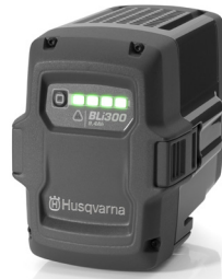
HUSQVARNA BATTERY BLI300 967 96 43-01