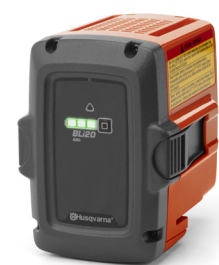
HUSQVARNA BATTERY BLI20 967 09 17-01