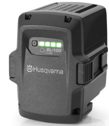
HUSQVARNA BATTERY BLI100 967 96 39-01