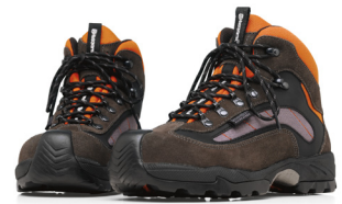
PROTECTIVE BOOTS TECHNICAL 575 35 47-41