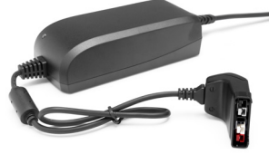
HUSQVARNA CHARGER QC80 967 96 47-01