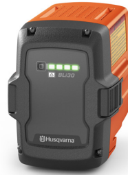
HUSQVARNA BATTERY BLI30 967 93 77-01