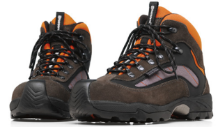
PROTECTIVE BOOTS TECHNICAL 575 35 47-45