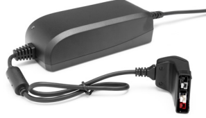
HUSQVARNA BATTERY CHARGER 967 33 56-71