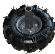
RUBBER WHEELS KIT 588 26 69-01