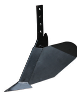
HUSQVARNA DITCHING BLADE 588 26 64-01