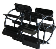
HUSQVARNA PADDY WHEEL KIT - EMM 588 26 68-01