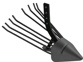
HUSQVARNA POTATOES HARVESTING PLOUGH 588 26 61-01