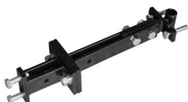
HUSQVARNA CONNECTING BRACKET B-TYPE 588 26 60-01