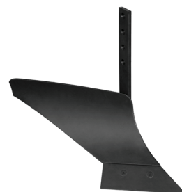
PLOUGH 588 26 67-01