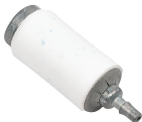
CHAINSAWS 530 09 56-46