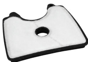
AIR FILTER 545 11 21-01