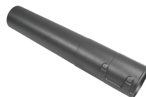
ROUND NOZZLE 125B, 125BX, 125BVX 545 11 80-01